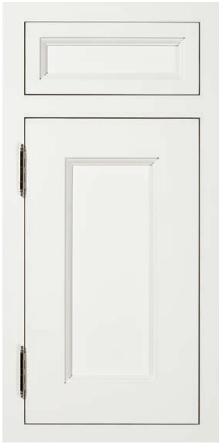
Whitehall Inset shown in Paint Grade with White Paint