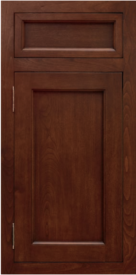
Hudson Inset shown in Cherry with Connecticut Stain