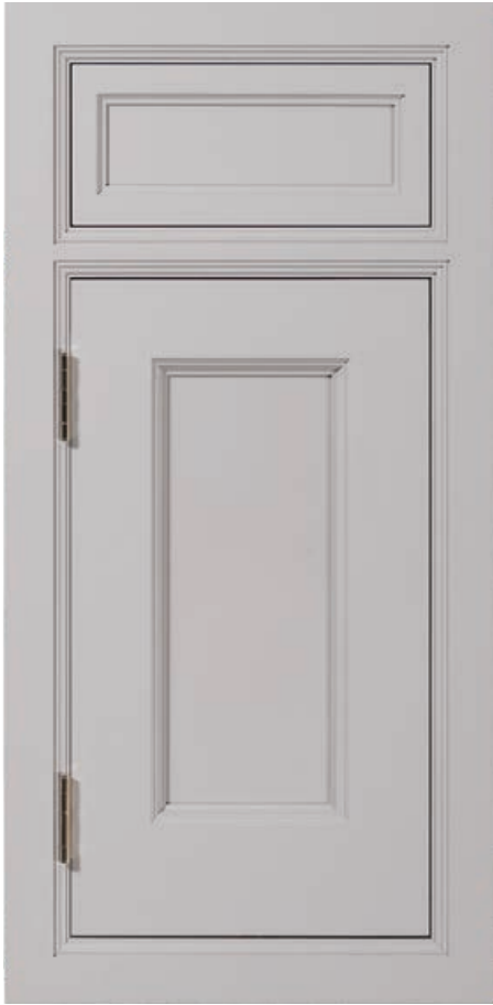
Ruskin Inset shown in Paint Grade with Brantwood Grey Paint