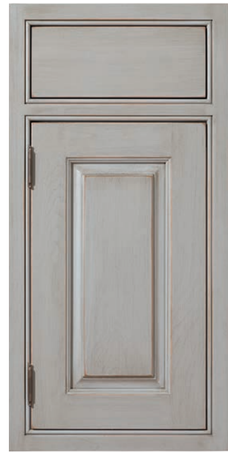
York Inset shown in Cherry with Davis Grey Paint and Sand- Through