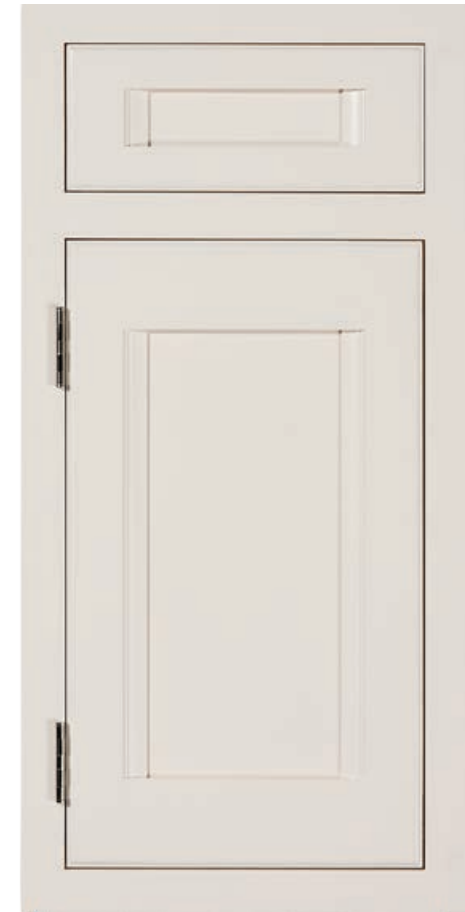
Breezes Inset shown in Paint Grade with Georgian White Paint