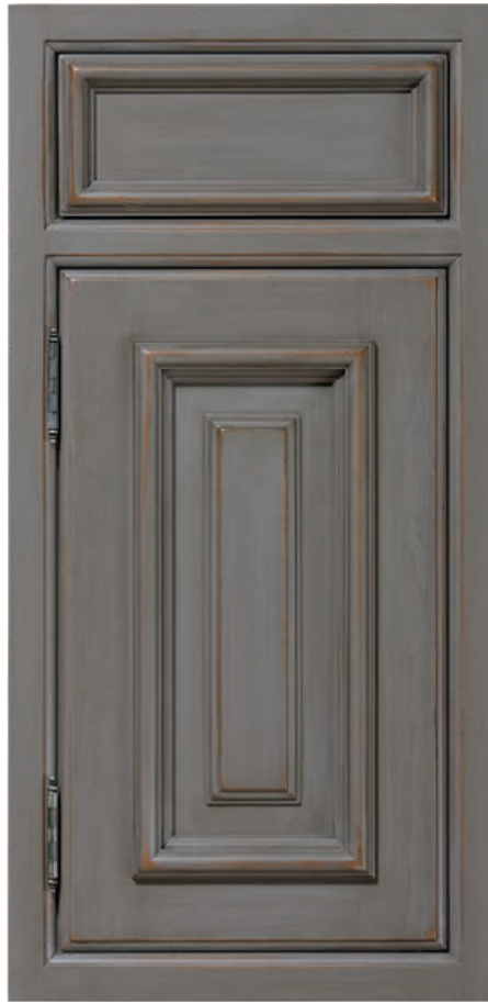
Loire Valley Inset shown in Cherry with Davis Grey Paint Brown Antiquing Glaze