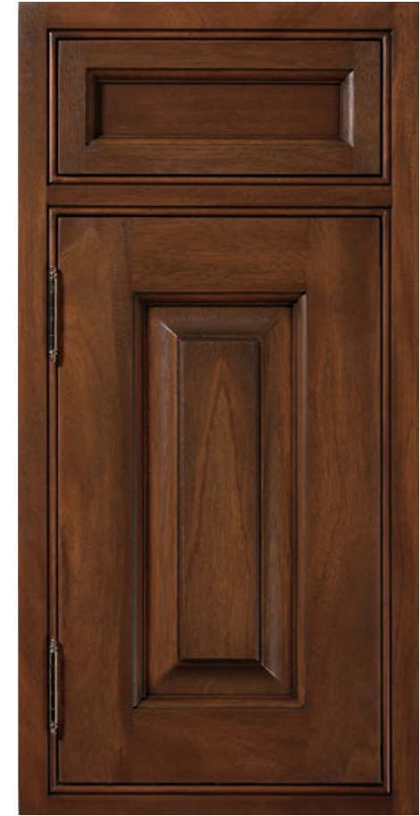
Whitehall Inset shown in Mahogany with Heirloom Brown Stain Grey Burnished Glaze