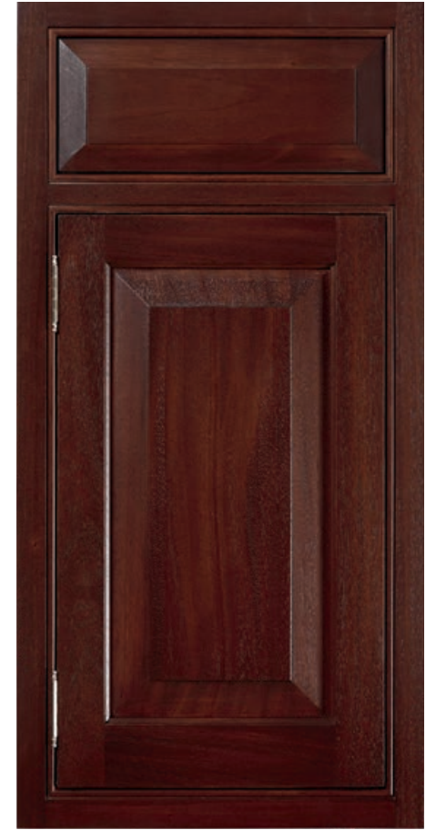
Georgetown Inset shown in Mahogany with Wainwright Stain