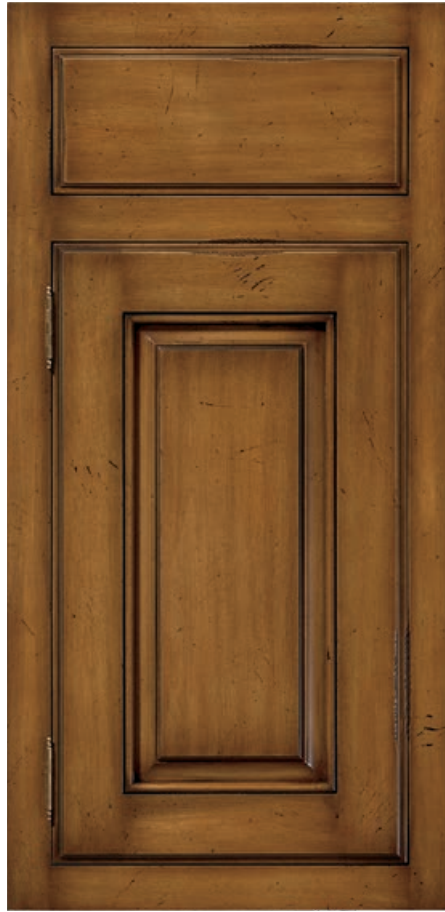
Bourbon Street Inset shown in Maple with Treasured Maple finish