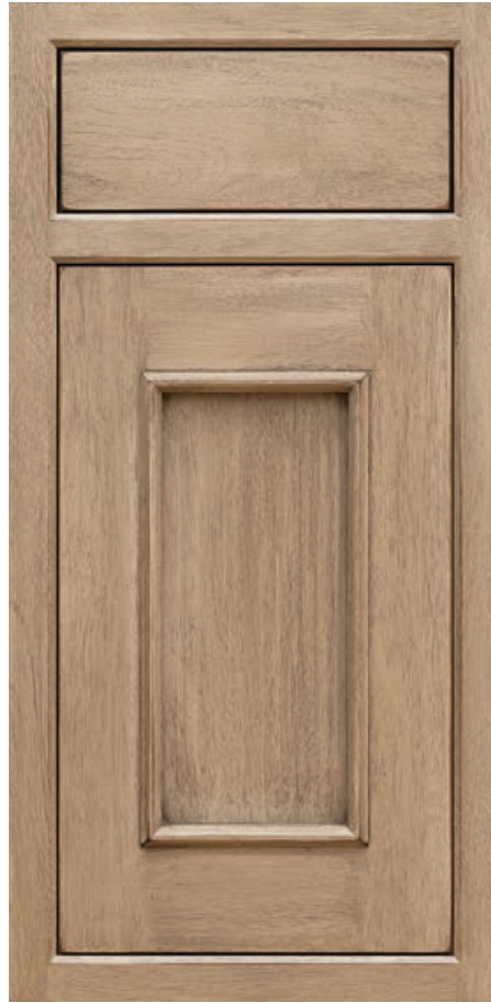
Tamuir Inset shown in Mahogany with Linen Paint Brown Antiquing Glaze