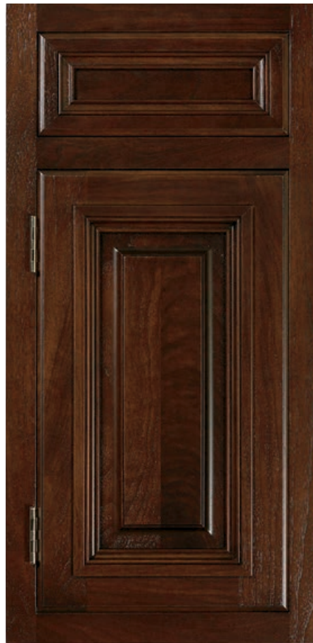
Wycombe Court Inset shown in Walnut with English Saddle Stain