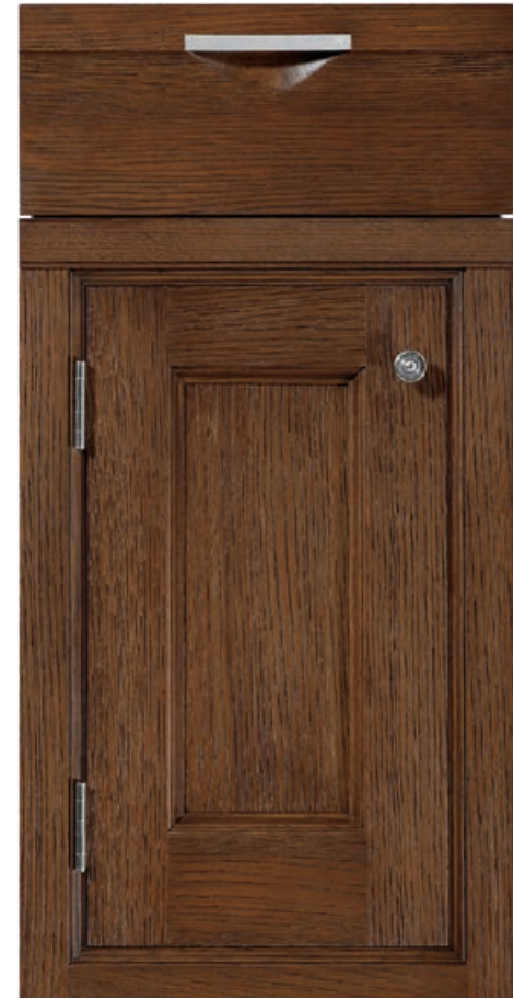
Ruskin Inset shown in Wire Brushed Rift Cut White Oak with English Saddle Stain and Optional Coved Drawer Front