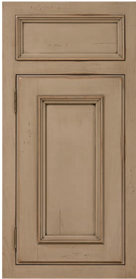
Manor House Inset shown in Cherry with Canyon Paint Brown Burnished Glaze - Cobbled Distressing