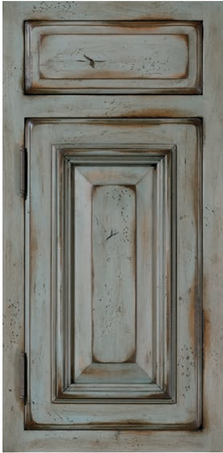
Bordeaux Inset shown in Rustic Cherry with Stonewashed Denim finish