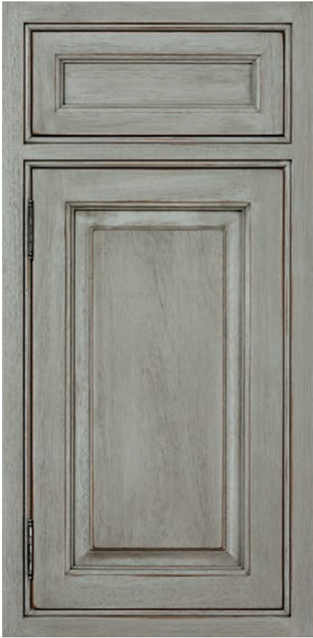
Coventry Inset shown in Mahogany with Silver Lake Paint Grey Antiquing Glaze