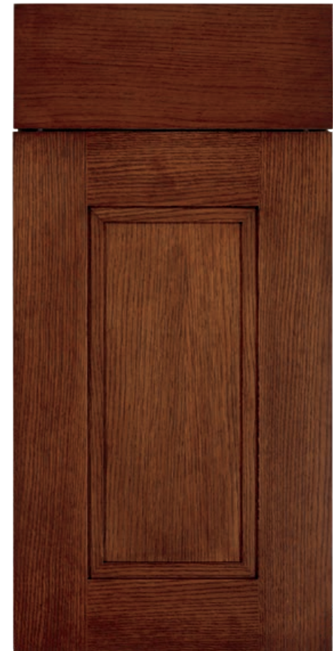
Modern Craftsman shown in Rift Cut White Oak with Heirloom Brown Stain