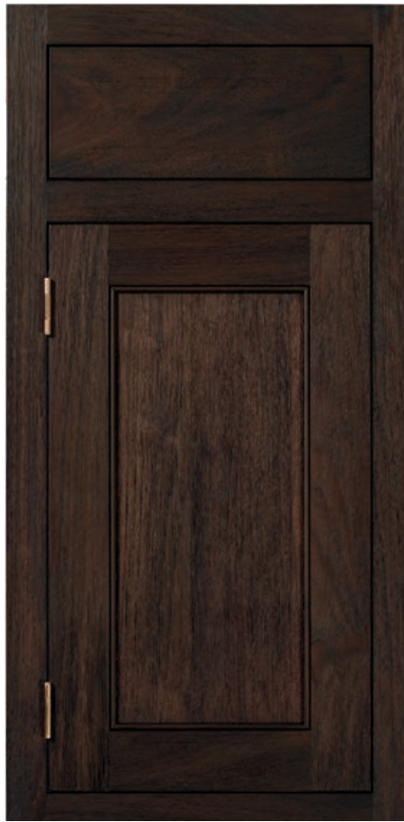
Oak Park Inset shown in Walnut with Charcoal Stain