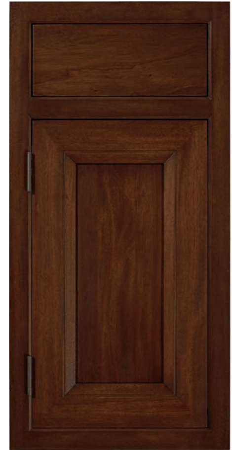
Lombard Inset shown in Mahogany with Heirloom Brown Stain