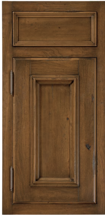
Florentine Inset shown in Rustic Cherry with Winter Wheat Stain Black Antiquing Glaze - Cobbled Distressing