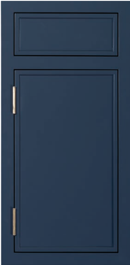
Manhattan Inset shown in Paint Grade with Hale Navy Paint