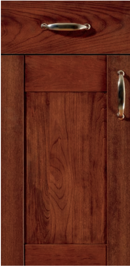
Morgan shown in Cherry with Warm Caramel Stain