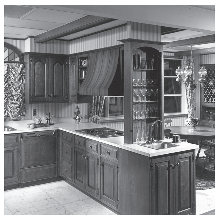
Rutt Kitchen Circa 1960's