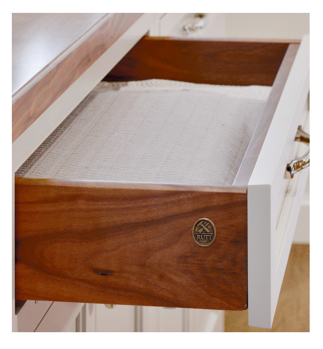
NEW YORKER INSET Shown in Super White Bilotta Kitchens – New York, NY