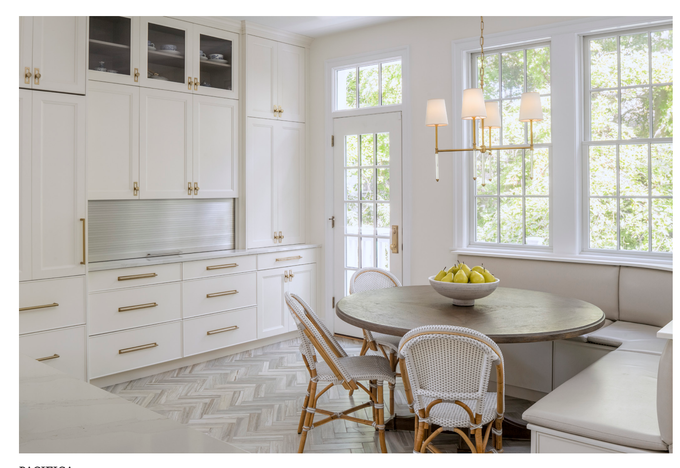
PACIFICA Shown in Linen Kitchen Cove Cabinetry & Design – Portland, ME

Shown in Keswick Oak | Super White Paint | Natural Walnut (island) Manhattan Center for Kitchen & Bath - New York, NY